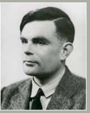
Alan Turing, mathematician and computer pioneer.

The Institute will build on the UK's existing academic strengths and help position the country as a world leader in the analysis and application of big data and algorithm research. Its headquarters will be based at the British Library in London.