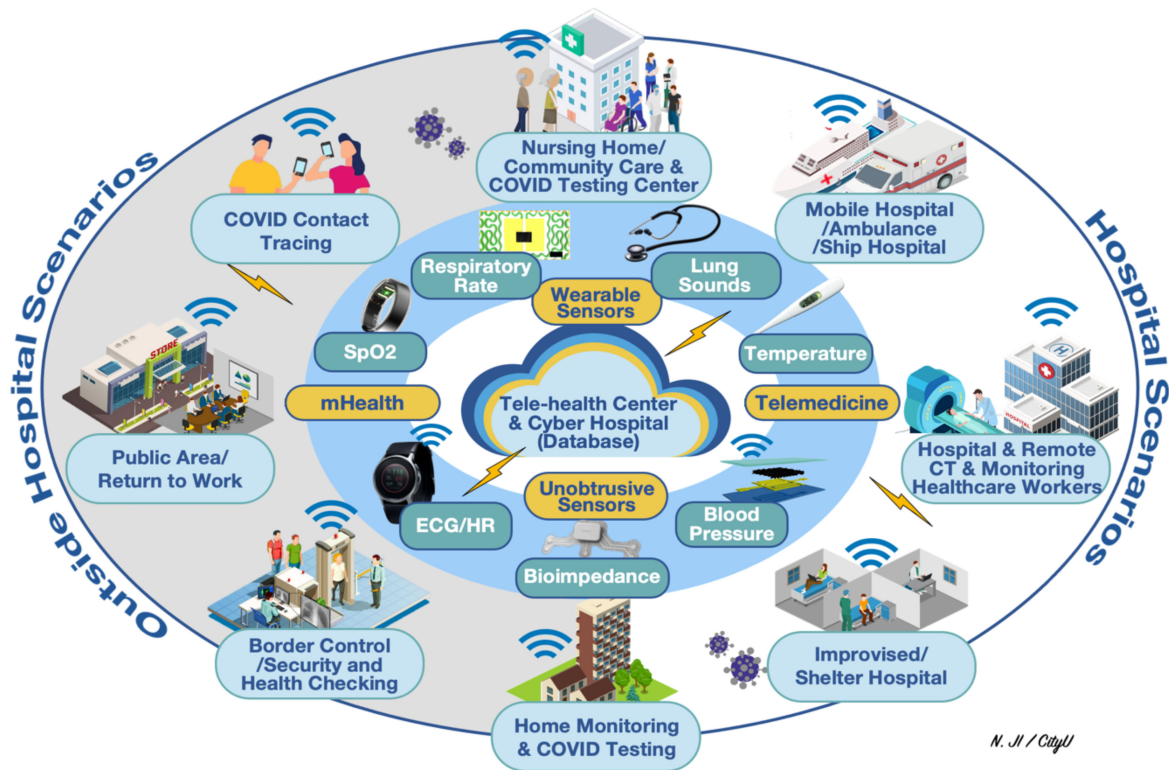
Fig. 1. Application scenarios for wearable sensors during pandemics [3], [4].

with molecular testing related to the COVID-19 and/or acute CVD symptoms in real world scenarios (see Fig. 1) [3], [4], has a huge potential to address this challenge and are expected to be better integrated in the inside/outside hospital workflow [5]. However, wearable sensors and mHealth have not been fully utilized in pandemic control to date. In this work, specific application scenarios encompassing the use of wearable sensors and mHealth in closed-loop management of acute CVD patients during the COVID pandemic are proposed. This could help to triage patients before hospitalization and provide opportunities to remotely monitor the health status of both patients and caregivers so as to limit virus spread and avoid cross-infections while assisting to provide emergency services timely to acute CVD patients.